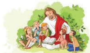
CHILDREN'S LITURGY AT SUNDAY MASS

They have written the Prayers of the Faithful and have practiced serving during the Mass with enthusiasm. If you have children in the morning session of classes, please come to this liturgy and join in celebrating with our wonderful children.