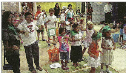
Saint Egbert, Morehead City