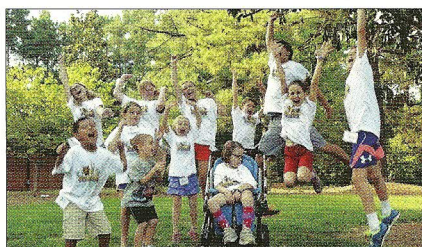
Holy Infant, Durham