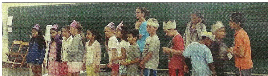
Saint Raphael, Raleigh